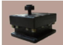
Stock No. 1250-0081