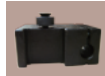
Stock No. 1250-0083