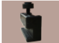
Stock No. 1250-0079