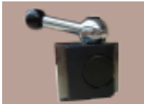
Stock No. 1250-0077