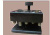
Stock No. 1250-0085