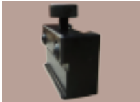
Stock No. 1250-0183